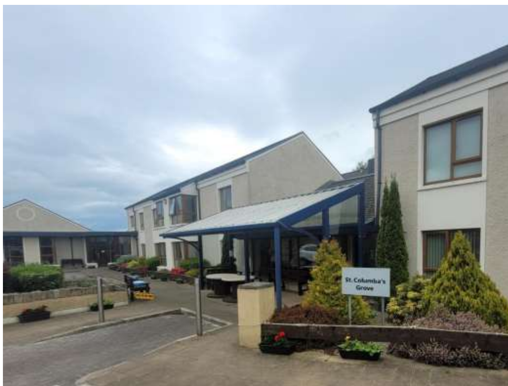
St. Columba's Grove, Lifford, Co. Donegal

Habinteg Housing Association in Lifford, Co. Donegal has 2 one-bedroom apartments available. The apartments are in a sheltered housing unit - a warden is on site during normal working hours.